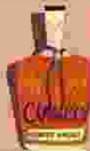
American Blended Whiskey