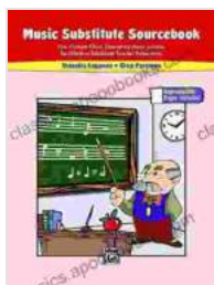
image alt="The Music Substitute Sourcebook Grades K–12 book cover"