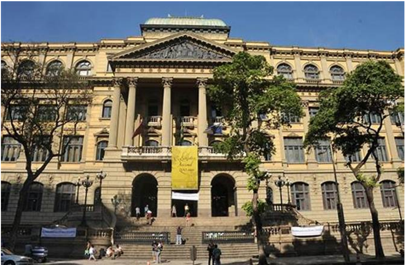
Museu Histórico Nacional

The Museu Histórico Nacional is housed in a historic building that once served as the Imperial Palace. It tells the story of Brazil's history from pre-colonial times to the present day. The museum's collection includes artifacts, documents, and paintings that provide a fascinating glimpse into the country's past.