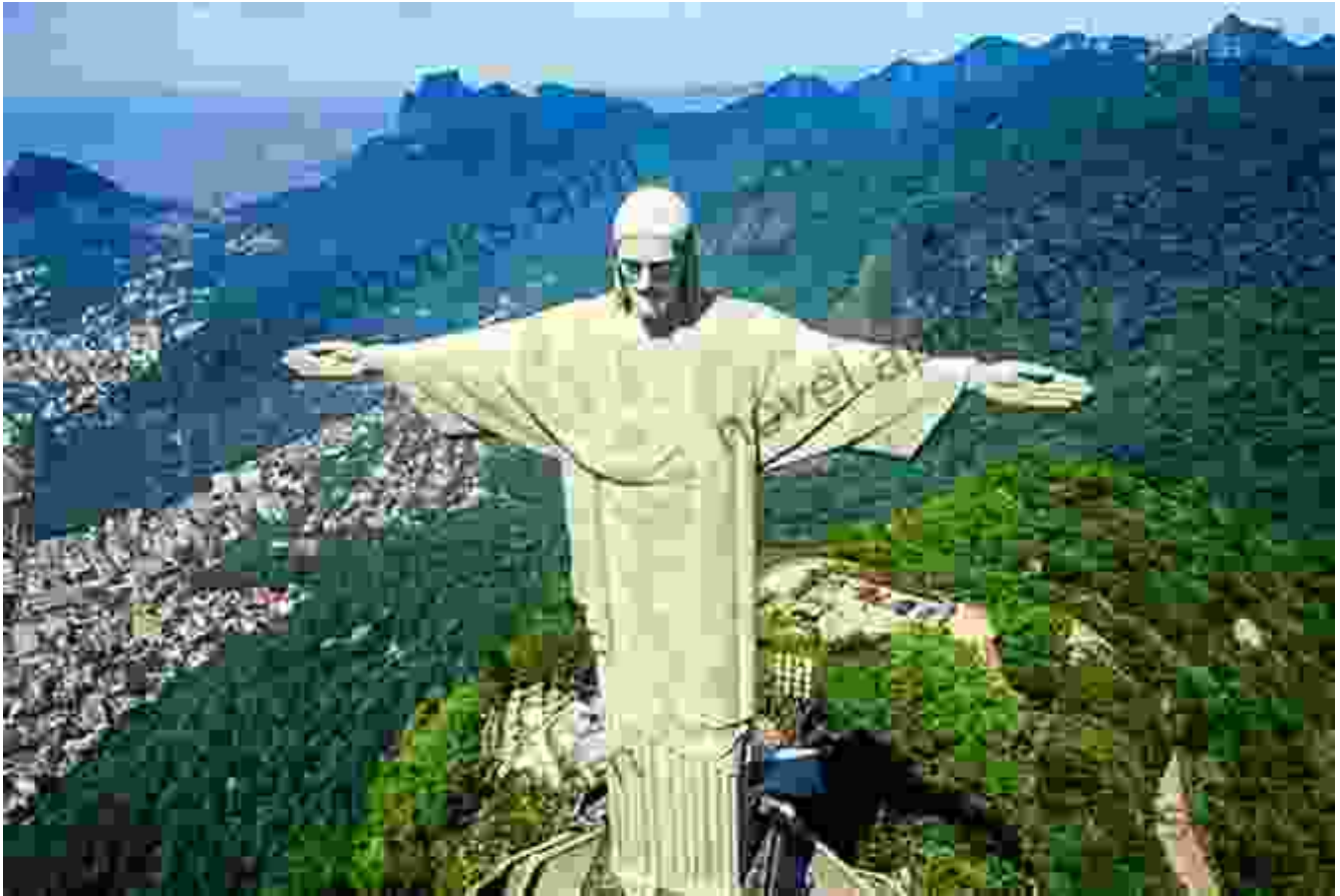
Christ the Redeemer Statue