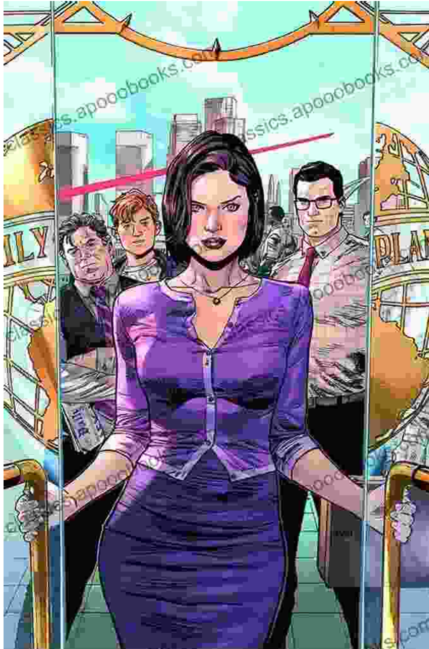
Lois Lane, Superman's fearless and brilliant love interest.